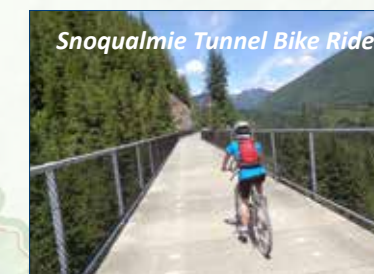
Snoqualmie Tunnel Bike Ride

These events provide an opportunity to explore the Greenway from a new perspective, and offer sponsors a way to connect directly with participants.