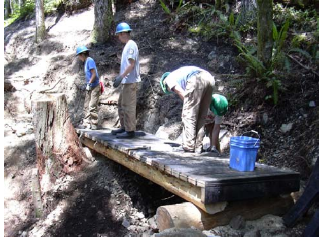
Volunteers build a new hiking bridge on Rattlesnake Mountain