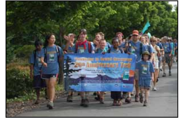
20 th Anniversary Trekkers go the distance over 9 days of biking and hiking in the Greenway.

In 2011, the Greenway Trust celebrated its 20 th anniversary with a variety of events, activities and educational opportunities for all ages including a 130-mile trek from Ellensburg to Seattle and a 20 th Anniversary Photo Contest and Traveling Exhibition.