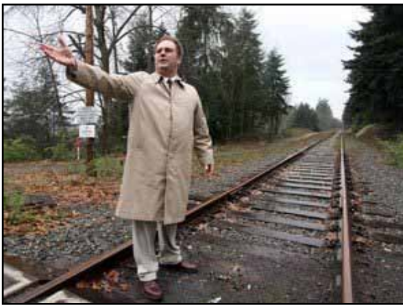
In the future, Kirkland will enjoy a section of regional trail allowing for recreational access to bicycles and pedestrians.

• The City of Kirkland purchased 5.75 miles of the East Side Rail Corridor to build a section of regional trail.