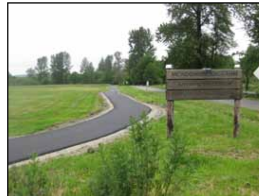
The new Boalch Trail at Meadowbrook Farm provides critical recreation access for local area residents and visitors.

• King County completed a major renovation of the Burke-Gilman Trail through Lake Forest Park and Kenmore. The new trail segment is 12 feet wide and provides glimpses of Lake Washington.