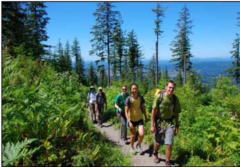
The Mountains to Sound Greenway offers easy access to nature and outdoor recreation just minutes from metropolitan areas.

Founded in 1991, the Greenway Trust coalition works to promote public land acquisitions, connect a continuous regional trail system, teach people of all ages about the importance of conserving forests and wildlife, improve recreation access, create new parks and trails and mobilize thousands of volunteers.