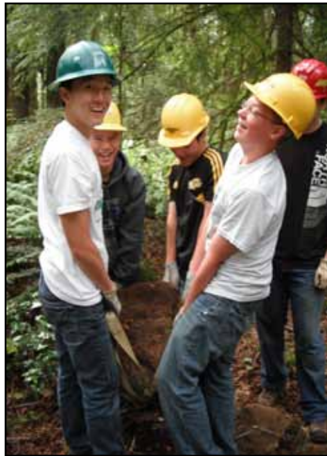
Greenway Summer Campers work together to make trails safe and accessible for public use.

• Greenway volunteers donated 50,772 hours to outdoor trail and restoration projects and planted 41,794 native trees and shrubs. Over 50% of volunteers were youth.