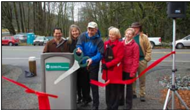
Partners working together to bring a project to success is a key philosophy of the Greenway Trust.

The Greenway Trust conducted an extensive study on the future of the Greenway that included active community participation of over 1,000 stakeholders over three years. Government agencies, local businesses and conservation organizations support the designation of the Greenway as a National Heritage Area.