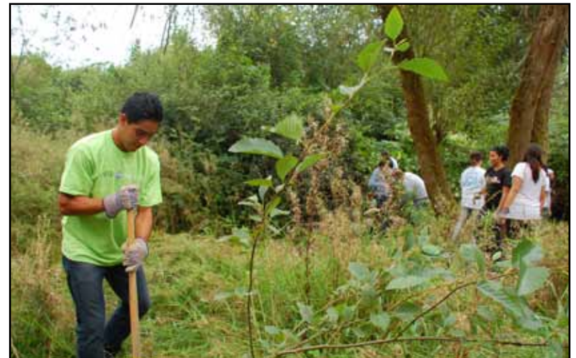
The Seattle Sounders help remove invasive weeds at Lake Sammamish State Park.

PCL Construction Quadrant Homes REI SAP America Seattle Bank Seattle Sounders Stoel Rives LLP Target The Boeing Company Thomson Reuters Trane Commercial Systems