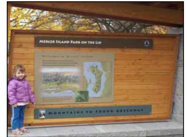
Kiosk at Mercer Island Lid Park

Eight kiosks were completed in Fall 2011 giving visitors to some of the Greenway's major recreation and visitor sites on public lands the chance to learn more about the surrounding area including trails, safety, conservation efforts, and the natural history of the Greenway landscape.