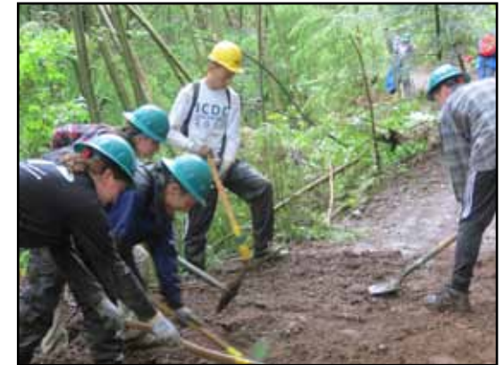
National Trails Day at Mailbox Peak brought more than 60 REI volunteers to help break ground on the new trail project.

• The Greenway Trust and WA State Department of Natural Resources began construction on a new 5-mile trail and trailhead at Mailbox Peak in the Middle Fork Snoqualmie River Valley. With additional support from federal and state partners and the Spring Trust for Trails, crews and volunteers will continue to work on this exciting trail project into 2013.