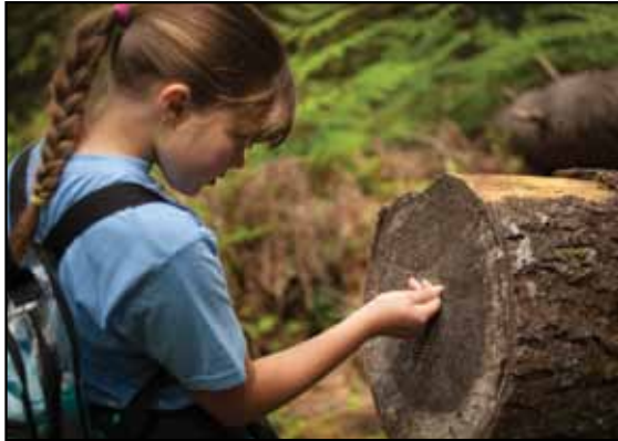
Learning in the outdoor classroom

• The Mountains to Sound Greenway Education Program taught 2,692 students in classrooms and 1,928 students on field study trips this year about the importance of salmon and wildlife, soils, forests and recycling biosolids. Volunteers from 19 classes participated in additional ecological restoration events after their education activities.