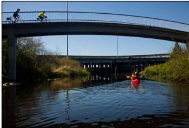
The Greenway is a special place. It's time to make it official.

In 2011, the Greenway Trust launched an official campaign to have the U.S. Congress designate the Mountains to Sound Greenway as a National Heritage Area.