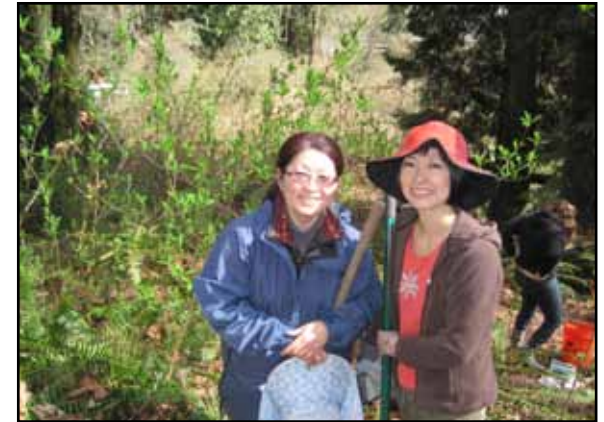
Volunteers at Bothell's North Creek Forest help restore and improve the ecological health of this important watershed.

• Irreplaceable fish and wildlife habitat, along with opportunities for hiking, birdwatching and taking in close-up views of the Snoqualmie River and Mount Si, have all been preserved by King County with the purchase of 21 acres of land adjacent the County's Three Forks Natural Area.