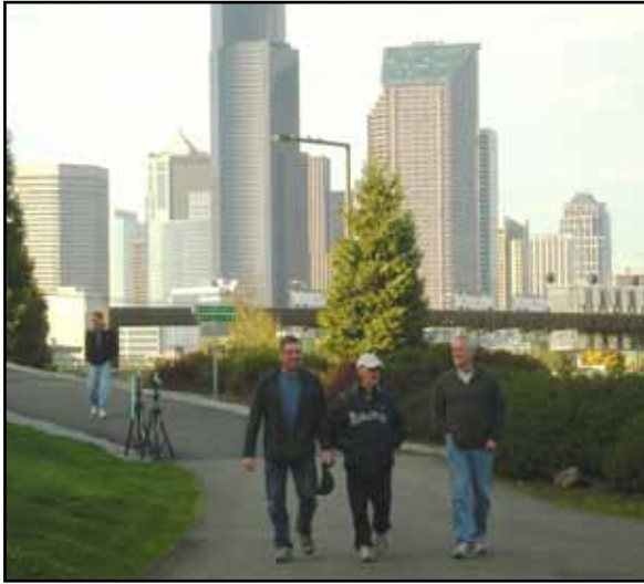
The new Mountains-to-Sound Trail provides stellar views of the Seattle skyline and Puget Sound.

• The Mountains-to-Sound Trail at José Rizal Park in South Seattle was completed through efforts from the Seattle Mayor's Office, Seattle Department of Transportation, Washington State Department of Transportation, and Seattle Parks and Recreation.