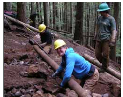
Greenway staff, field crews and volunteers have now rebuilt the popular, 4-mile trail to the summit of Mt. Si, just outside North Bend. A favorite training route for mountain climbers, Mt. Si has over 100,000 visitors each year. The new trail is designed and built to withstand heavy use.