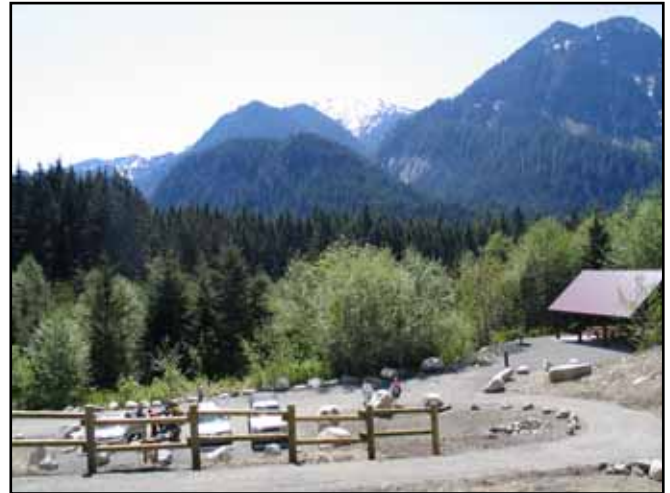
The new US Forest Service campground opened May 2006 in the Middle Fork Snoqualmie River Valley.