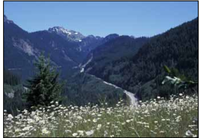
Looking east above Interstate 90 toward Snoqualmie Pass from the John Wayne Pioneer Trail.

THE GREENWAY TRUST: Since 1991, the Mountains to Sound Greenway Trust has brought together a coalition of foresters, land managers, businesses, recreation groups and interested citizens in a successful coalition to protect this 700,000-acre landscape and make this 'breathing room' accessible to people. In cooperation with all nine cities and two counties along I-90, the Greenway Trust works to connect regional trails so that hikers and bicyclists can travel safely from the Seattle waterfront to the mountains. The Trust mobilizes a year-around program that brings volunteers of all ages into the Greenway to restore and enhance public open spaces. King County classroom teachers have free access to the Greenway Trust Environmental Education Program. The Trust works continuously to bring people together to find solutions to the challenges of making the Greenway landscape safe, secure and permanent.